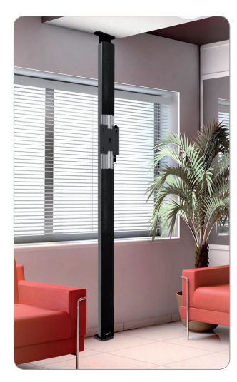
CTF Atlas - open + UFPRO