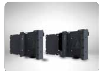
Optional equipment holder EC-1 or EC-1AC (incl. 3-fold power strip F, CEE 7/4)