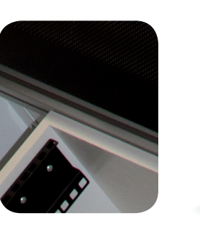
Detail Decor panel and 6HE 19" furniture