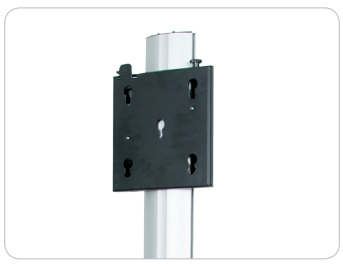
L & S 5 mounting interface