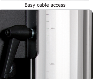
Flat panel position ruler