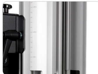
Easy cable access