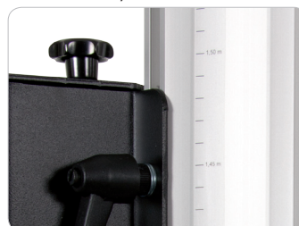
Flat panel position ruler