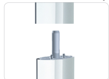
Quick release, perfect rental solution