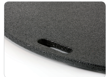
Available with scratch resistant coating