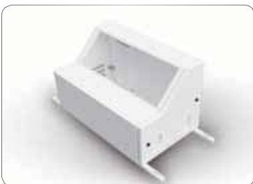
Custom short throw outdoor housing.