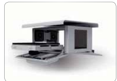
24/7 outdoor housing with high pressure ventilation & AC

A projector outdoor housing is actually a unique product which allows a large screen projector to be installed outside, 24/7. A well-designed ventilation/cooling system coupled with optimal accessibility of the projector results in a very efficient and compact housing.