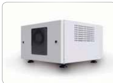
Standard concept outdoor housing.