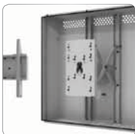
(FSMT-70) The flat panel is very easy accessible