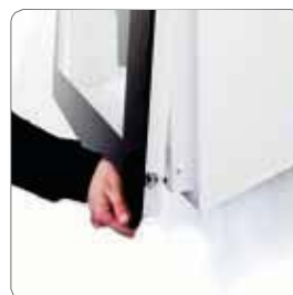
Easy access after unlocking the glass front