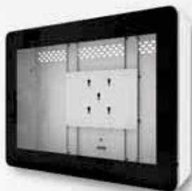
Colour: Black bezel, white housing, glass front