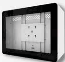
Colour: Black bezel, white housing glass front