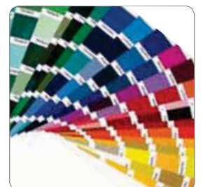
Optional available in any RAL colour