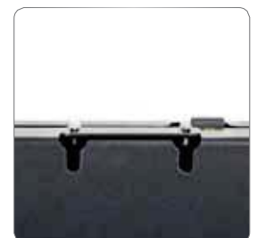
Lockable VESA mounting patterns