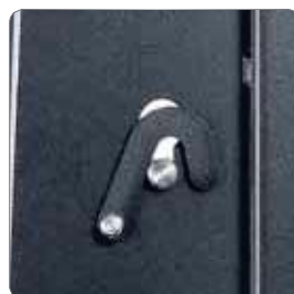
Locked when mounted with an Audipack mounting bracket