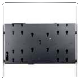
Mounting interface: VESA 400 x 200, 400 x 400, 600 x 200, 600 x 400 and L&S5